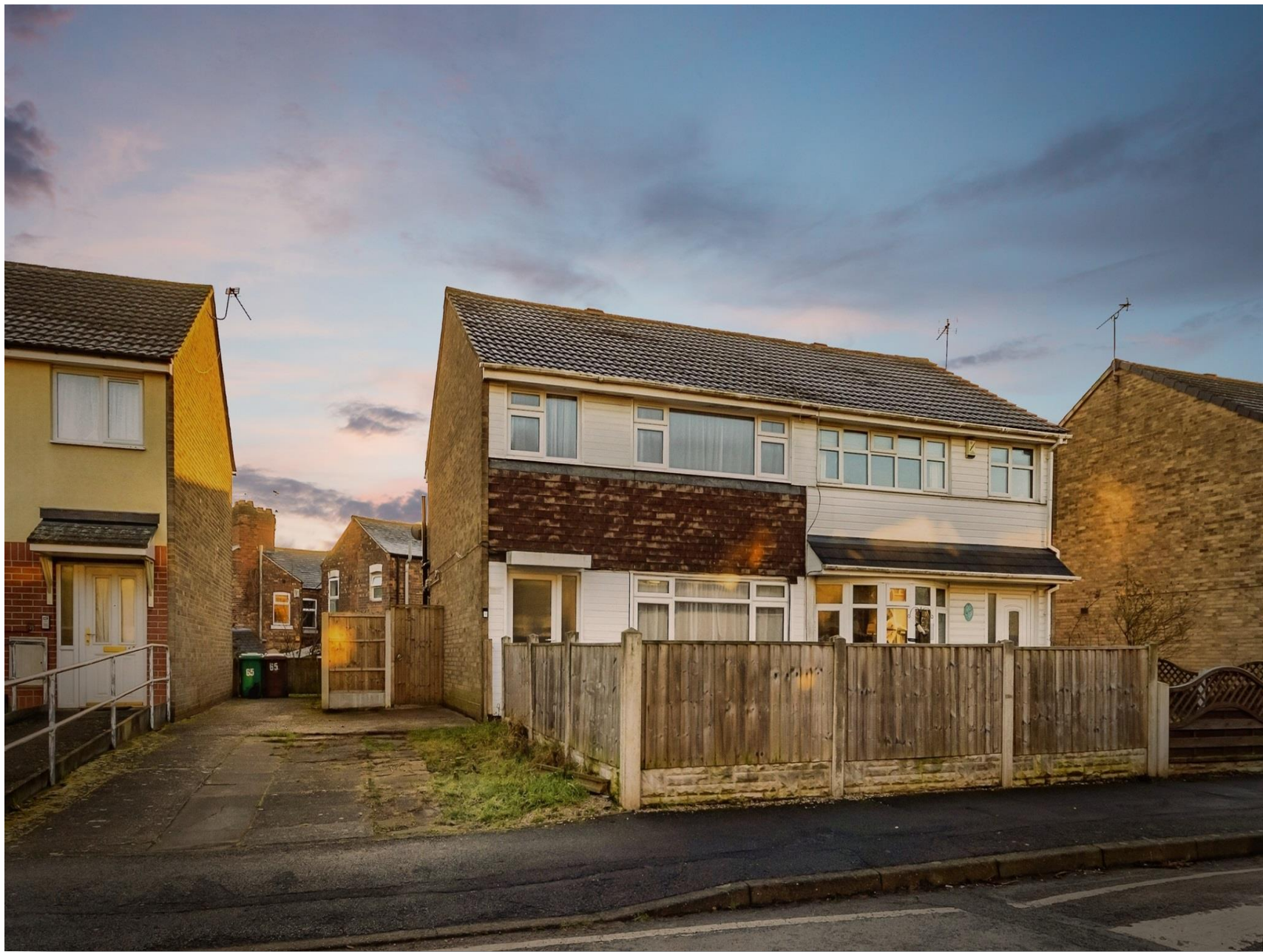
Wilford Crescent West, Nottingham NG2 2FT