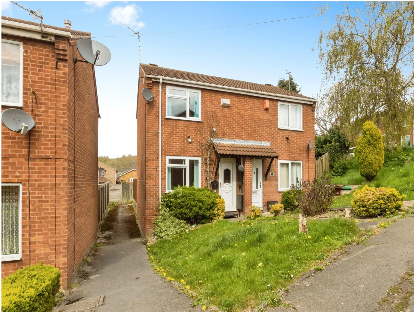
Mickleborough Avenue, Nottingham NG3 3EJ