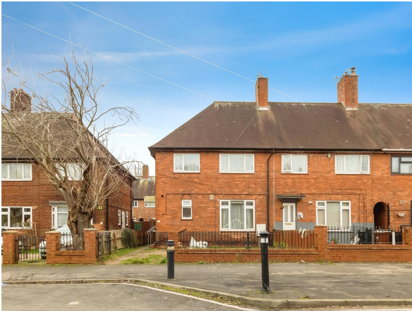
Woodfield Road, Nottingham NG8 6HU