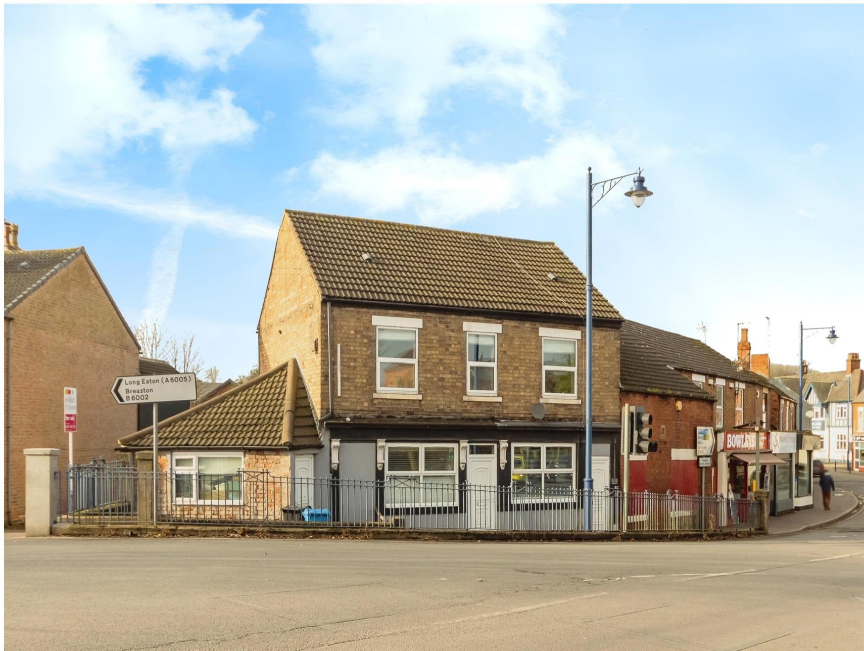
Derby Road, Sandiacre Nottingham NG10 5HS