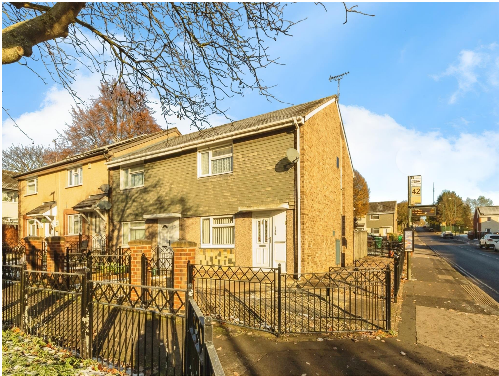
Abbotsford Drive, Nottingham NG3 1NE