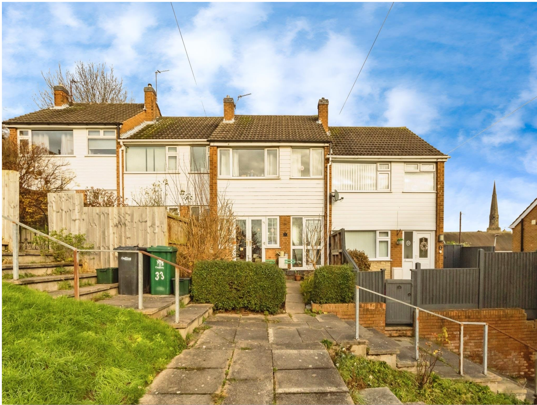
Third Avenue, Gedling Nottingham NG4 3LL