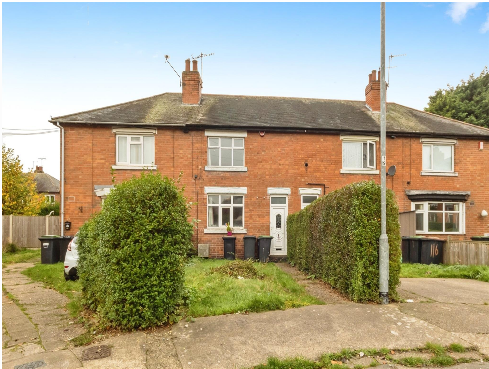
Trent Road, Beeston NOTTINGHAM NG9 1LQ