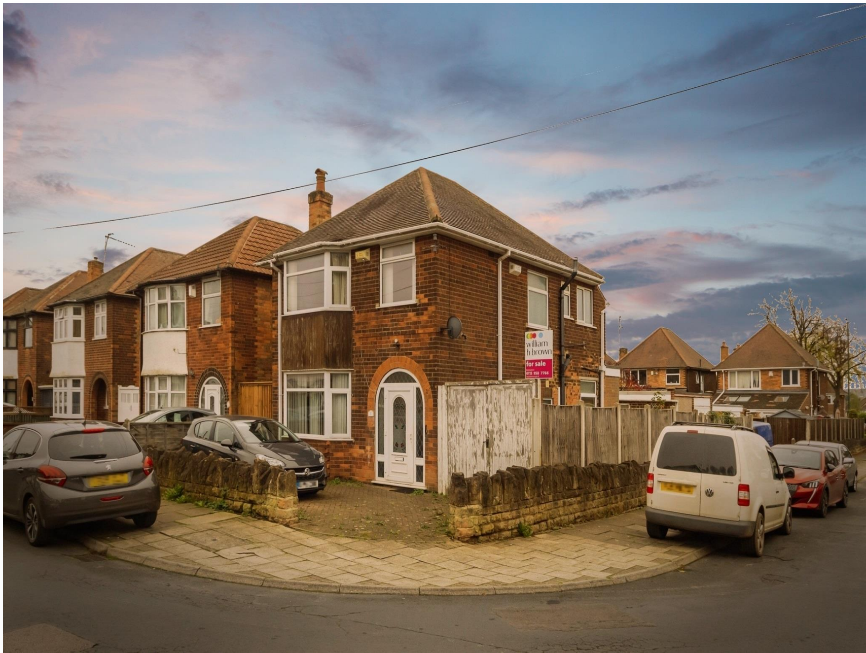
Newlyn Drive, Nottingham NG8 5GX