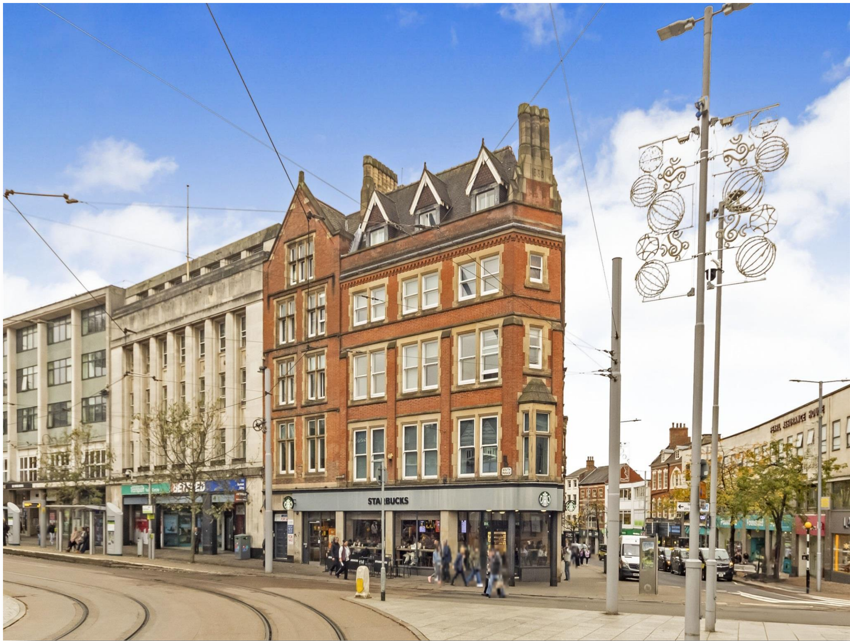
South Parade, NOTTINGHAM NG1 2JS