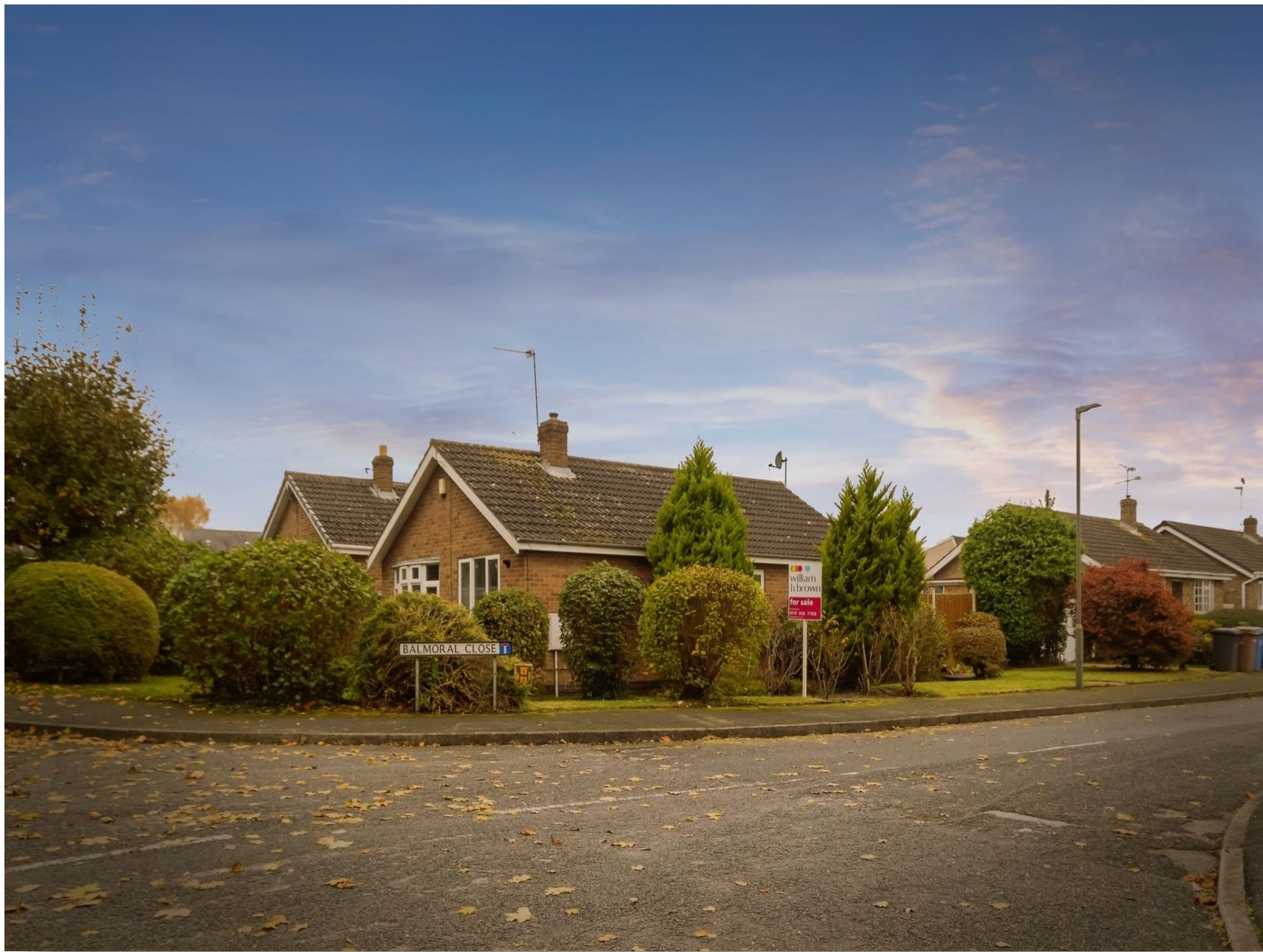
Balmoral Close, Sandiacre Nottingham NG10 5LF