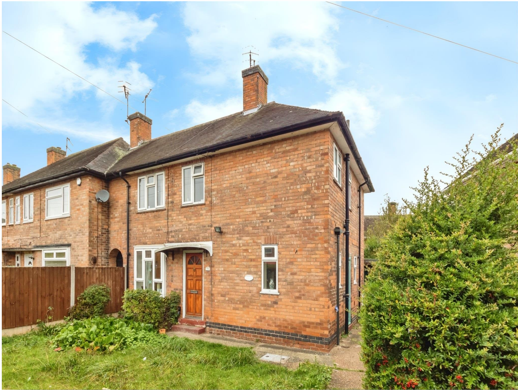
Southfield Road, Nottingham NG8 3PN