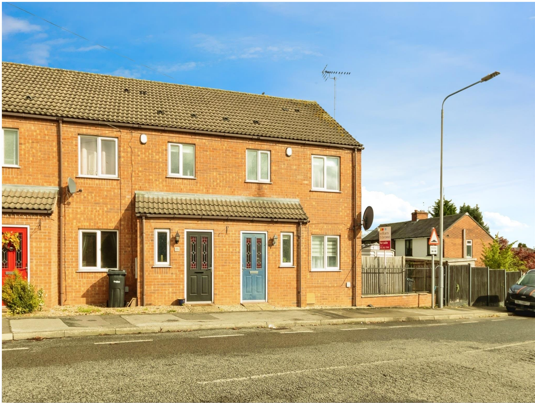
Foxhill Road, Carlton Nottingham NG4 1QD