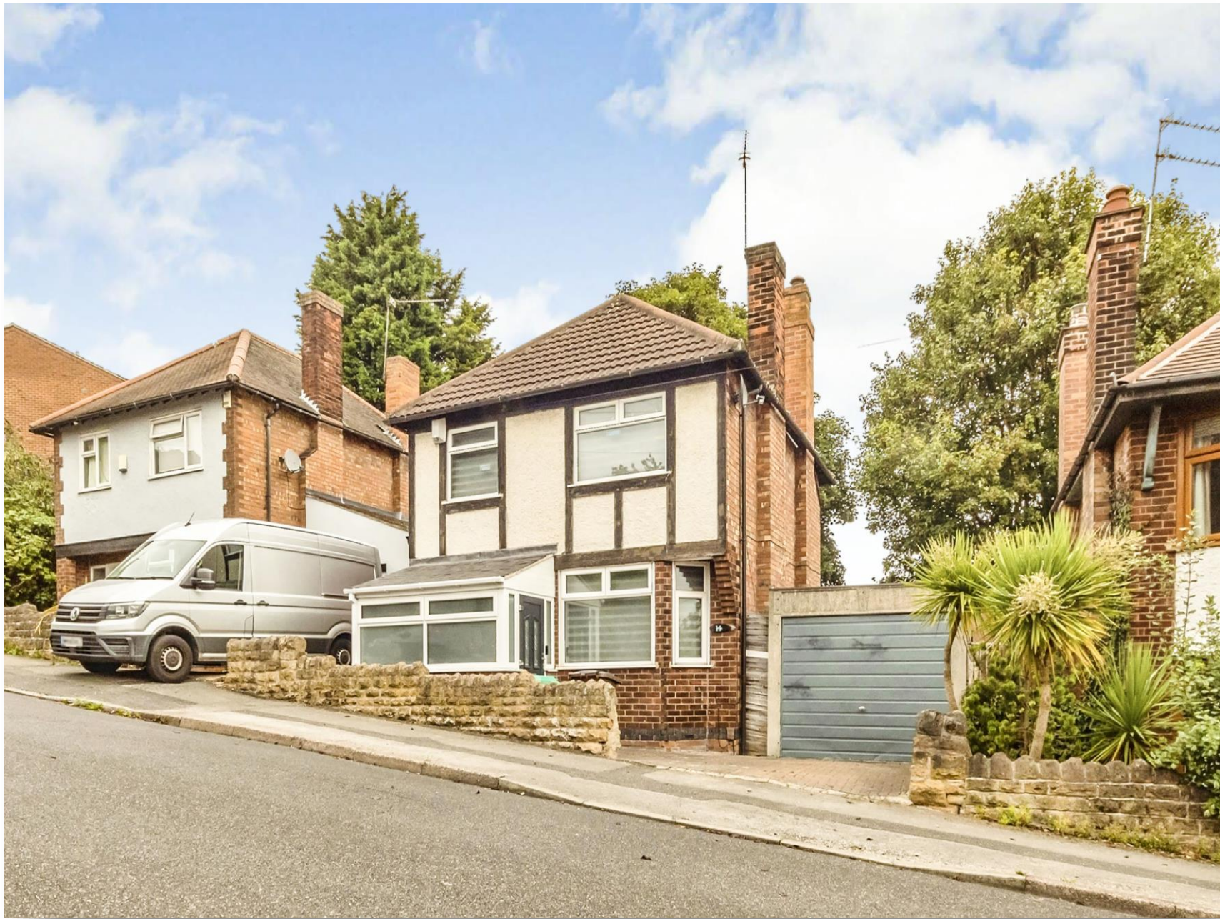
Alma Road, Nottingham NG3 2NU