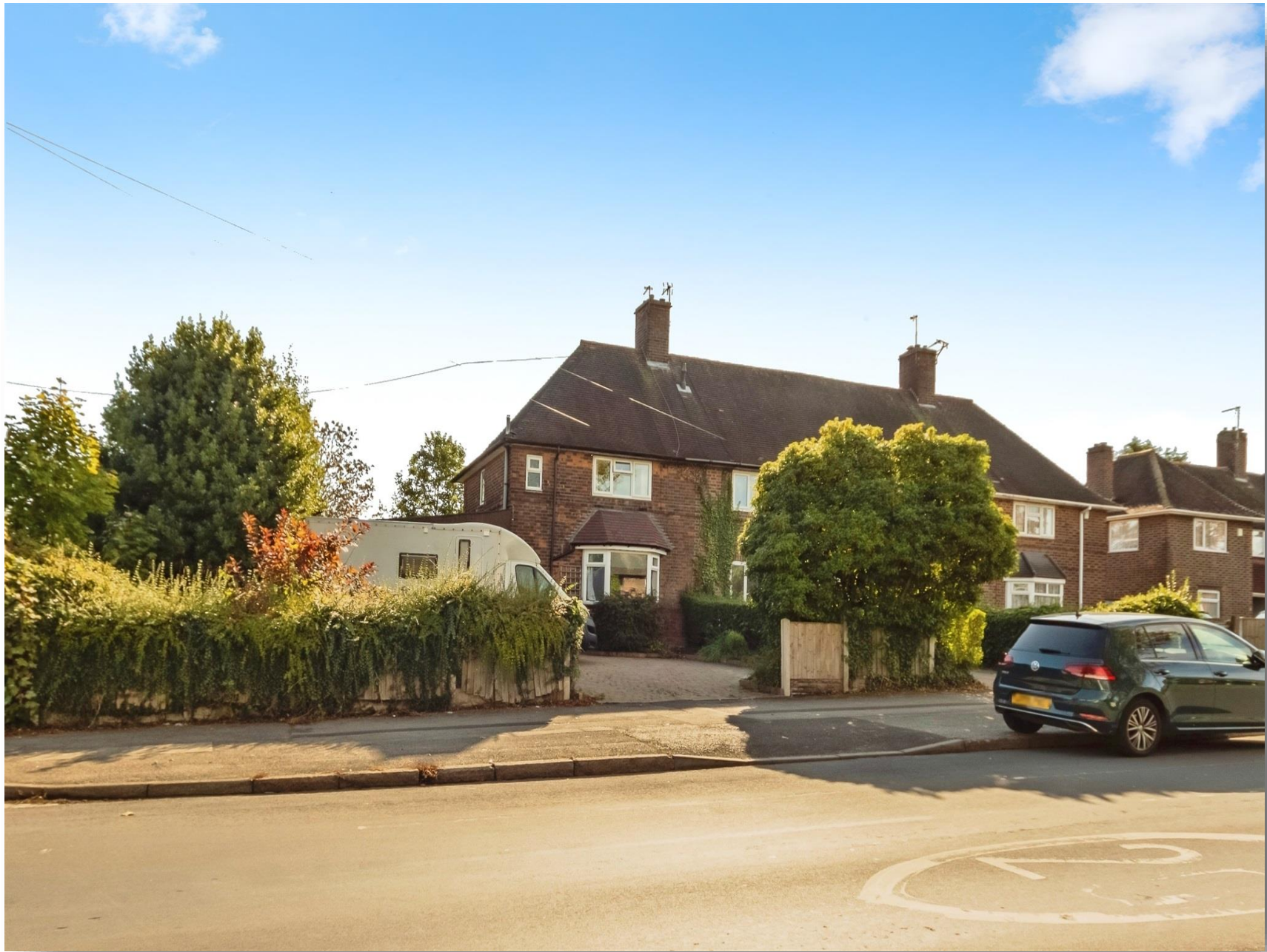
Melbourne Road, Nottingham NG8 5HL