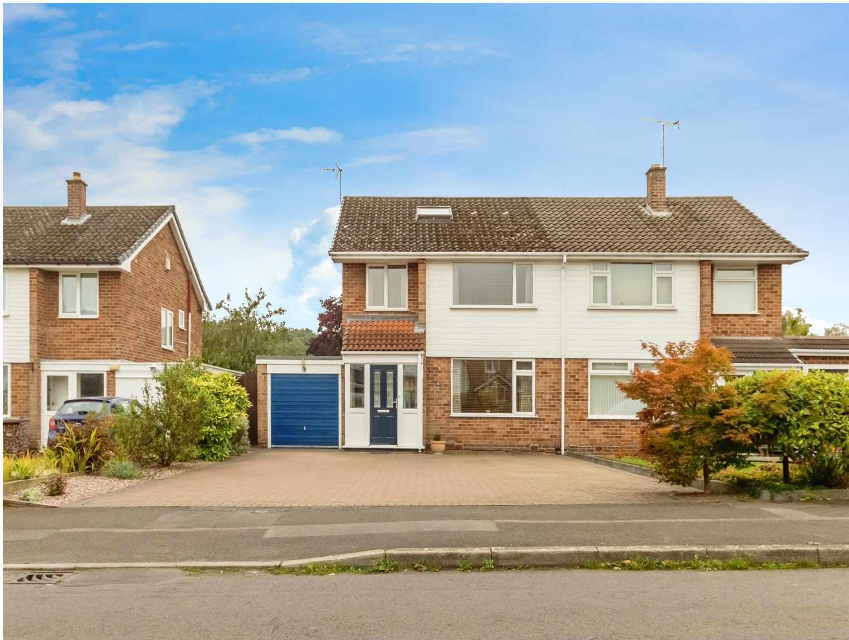
Woodbank Drive, Wollaton Nottingham NG8 2QU