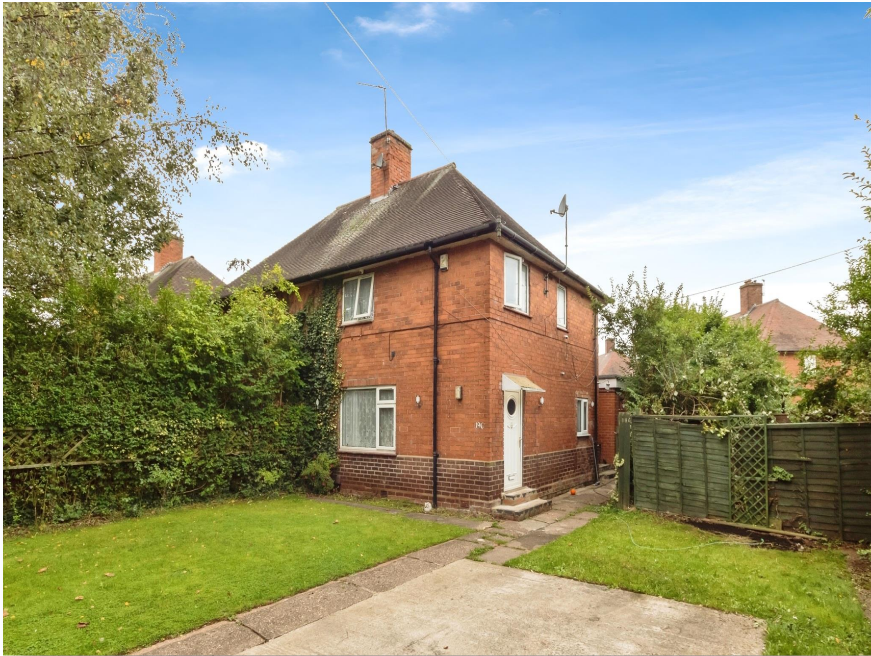
Broxtowe Lane, Nottingham NG8 5NA