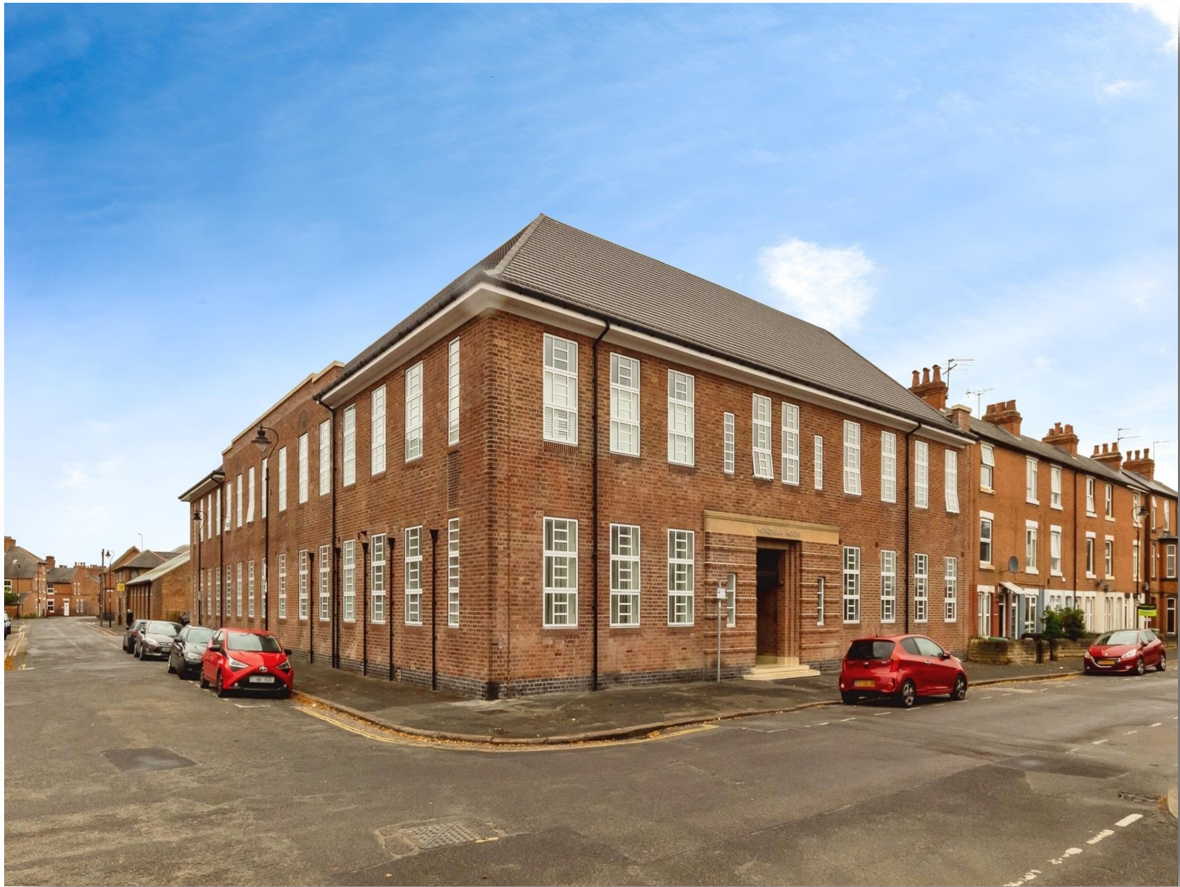
Mundella House Green Street, Nottingham NG2 2LA