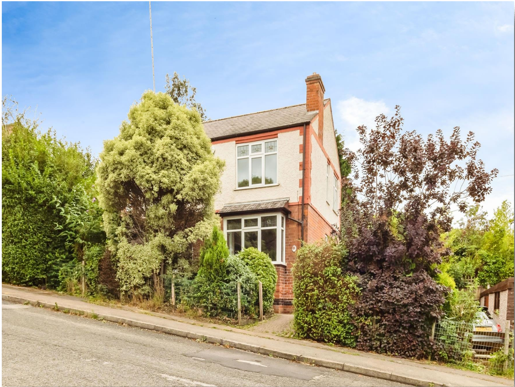
Simkin Avenue, Nottingham NG3 6HU