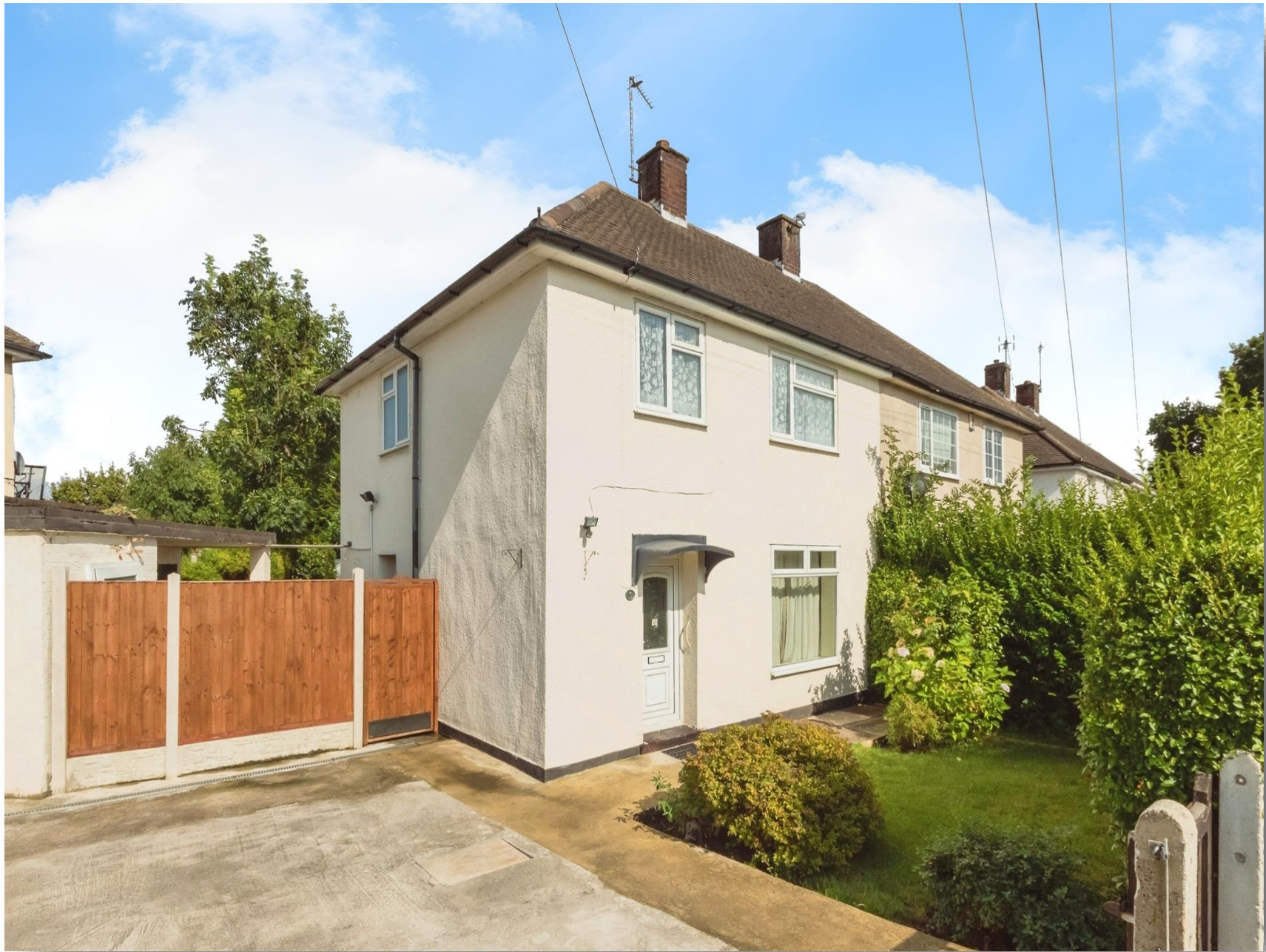
Westwick Road, Nottingham NG8 4HF