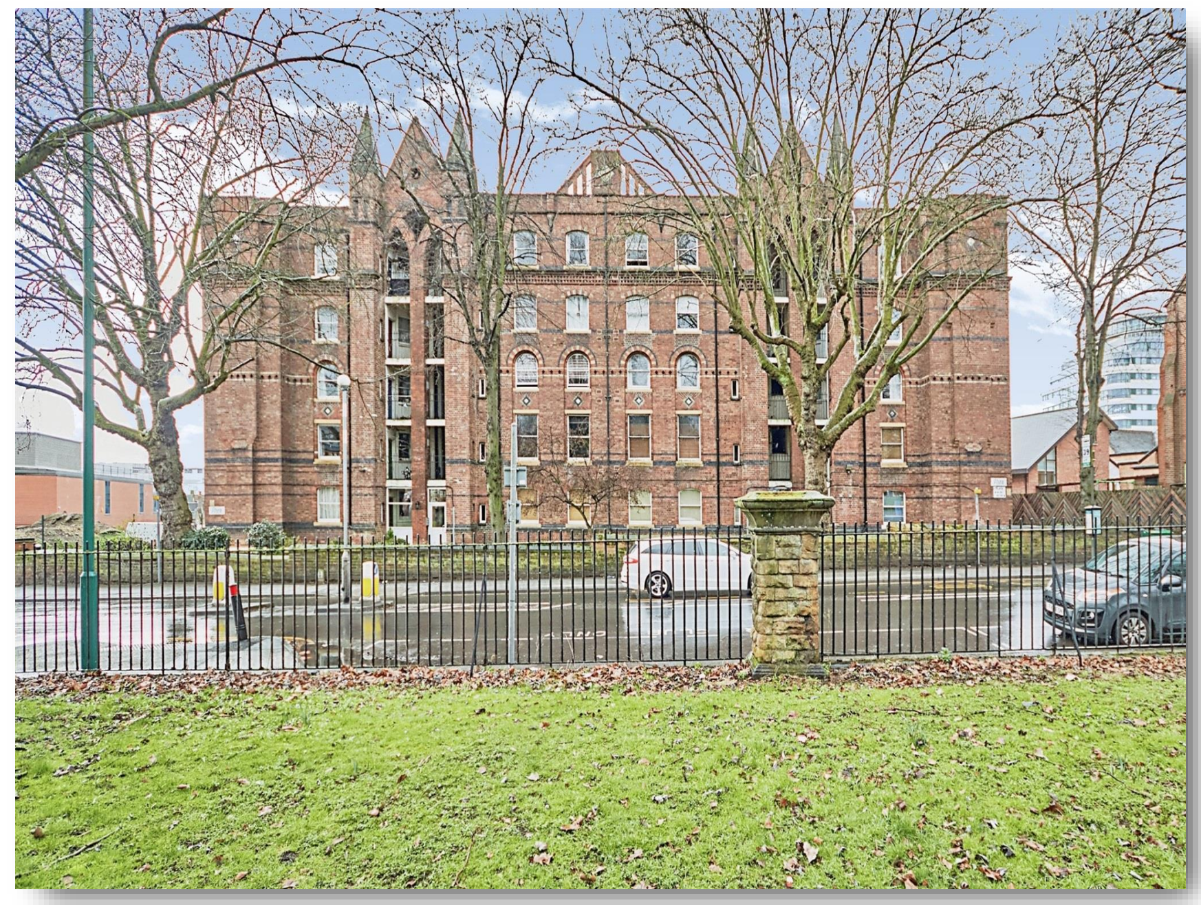
Park View Court, Nottingham NG1 1DE