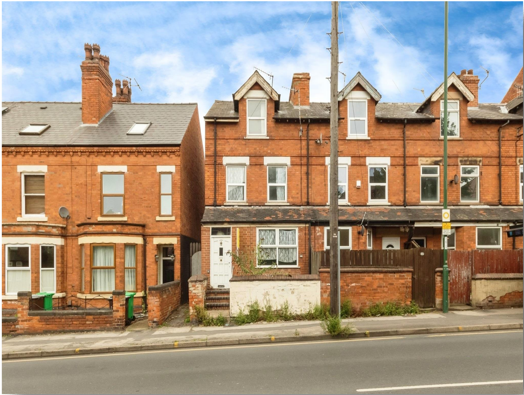
Nottingham Road, Nottingham NG7 7BA