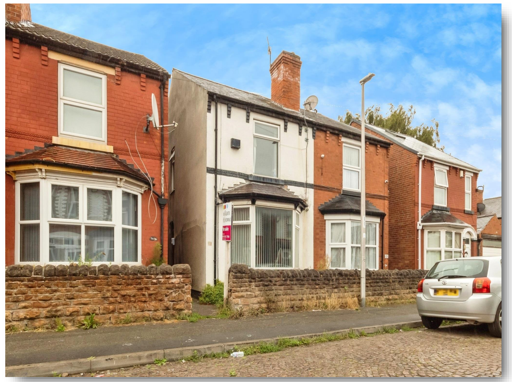
Stanley Road, Forest Fields Nottingham NG7 6PL