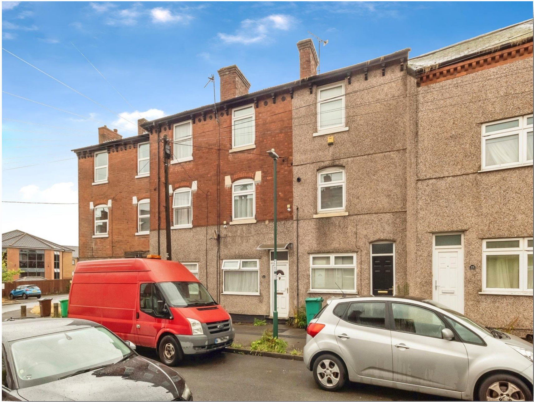
Loscoe Road, Nottingham NG5 2AW