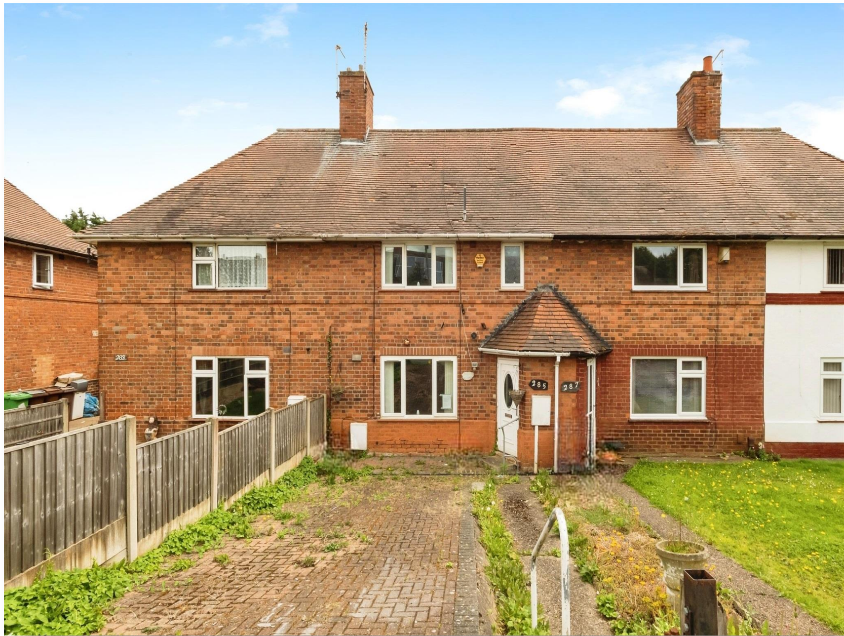
Broxtowe Lane, Nottingham NG8 5NE