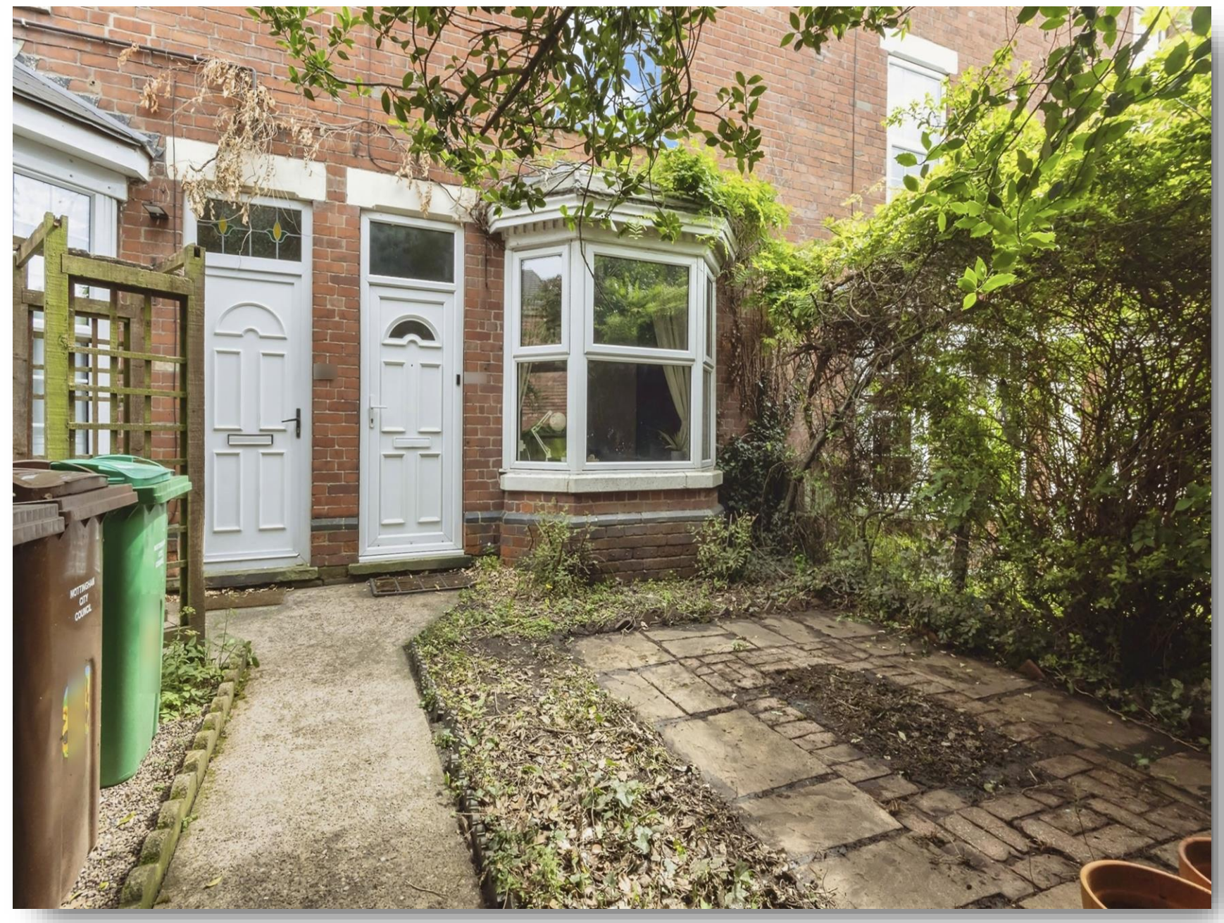
Egypt Road, Nottingham NG7 7GN