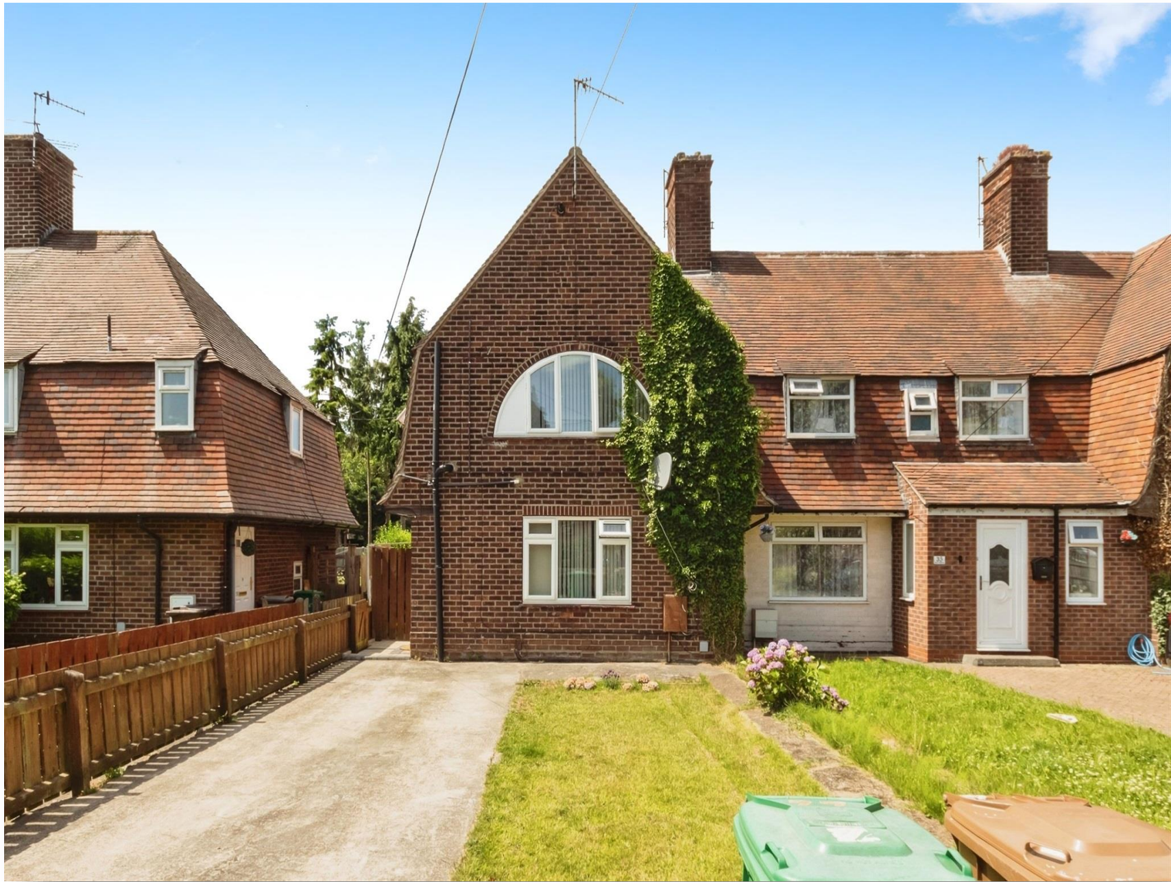
Western Boulevard, Nottingham NG8 1PE