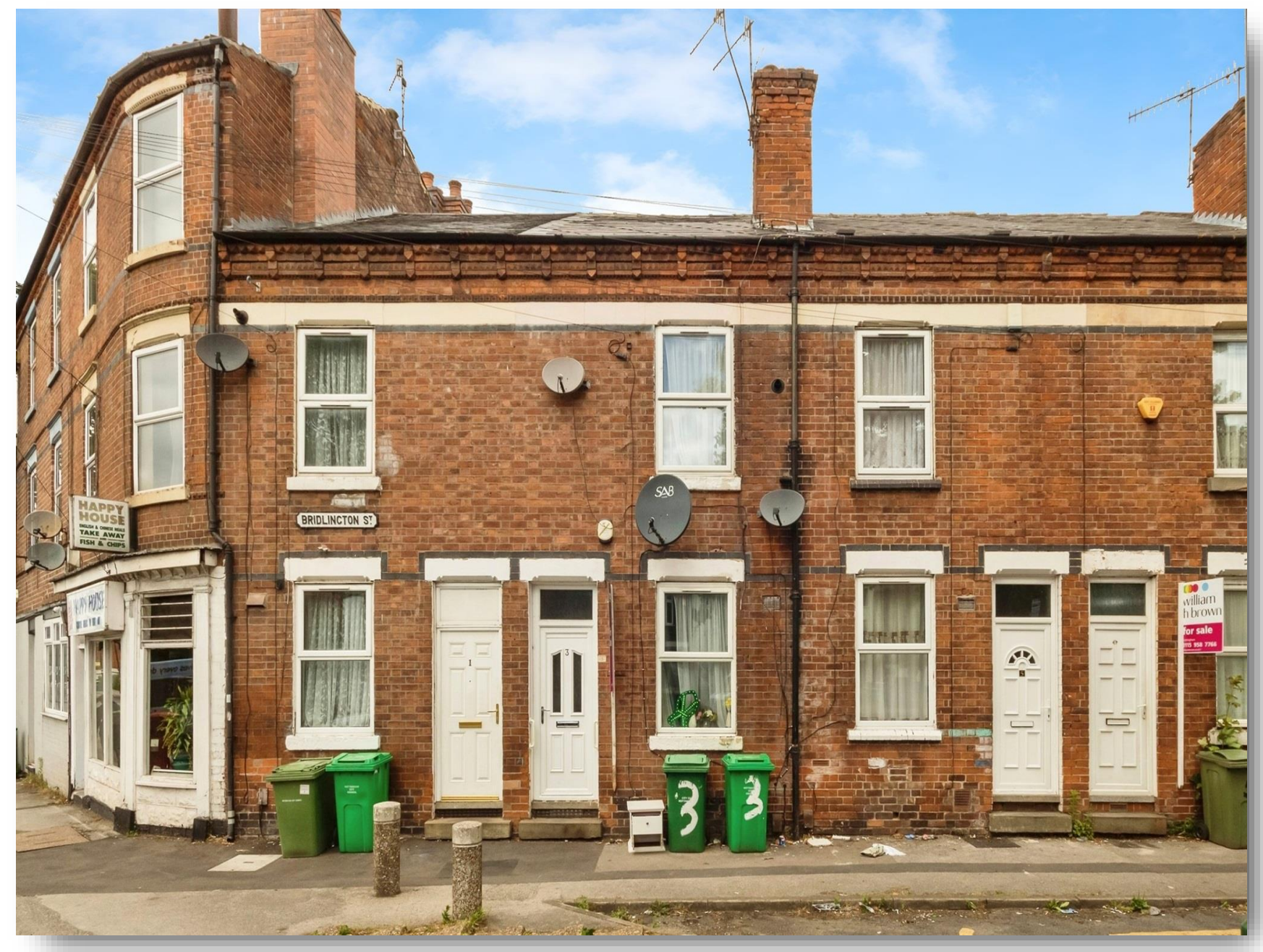
Bridlington Street, Nottingham NG7 5BG