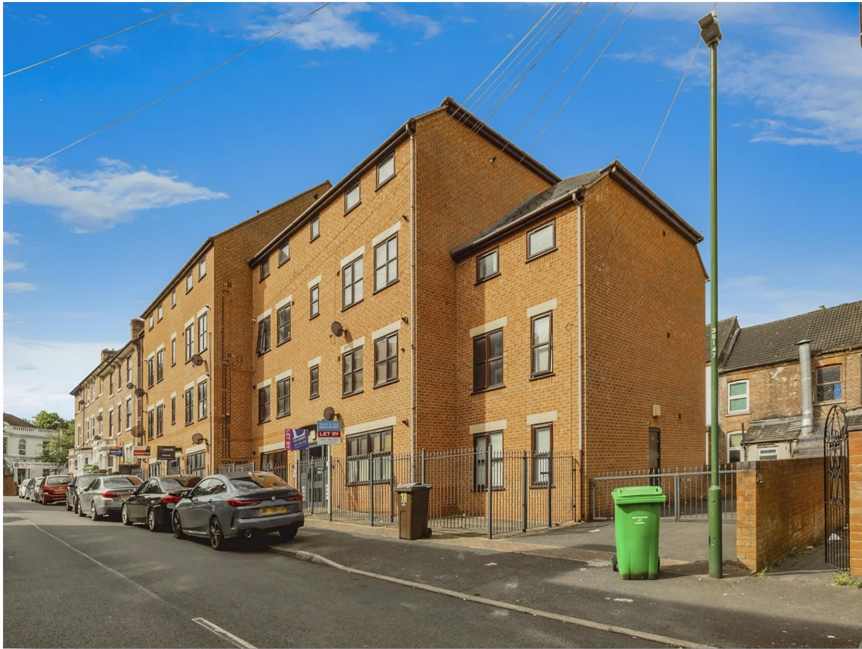
The Yard Sophie Road, Nottingham NG7 6AG