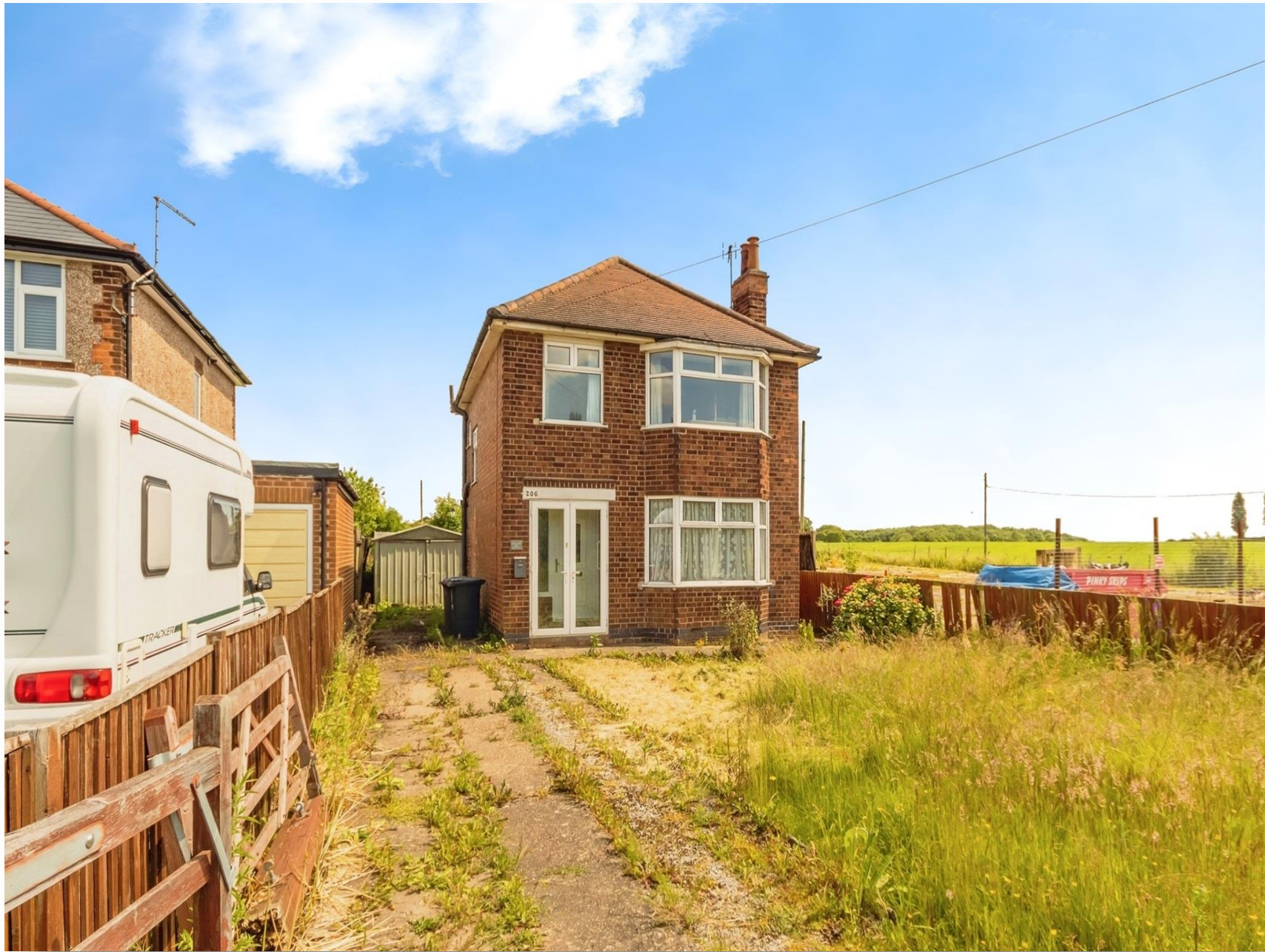
Lambley Lane, Gedling Nottingham NG4 4PB