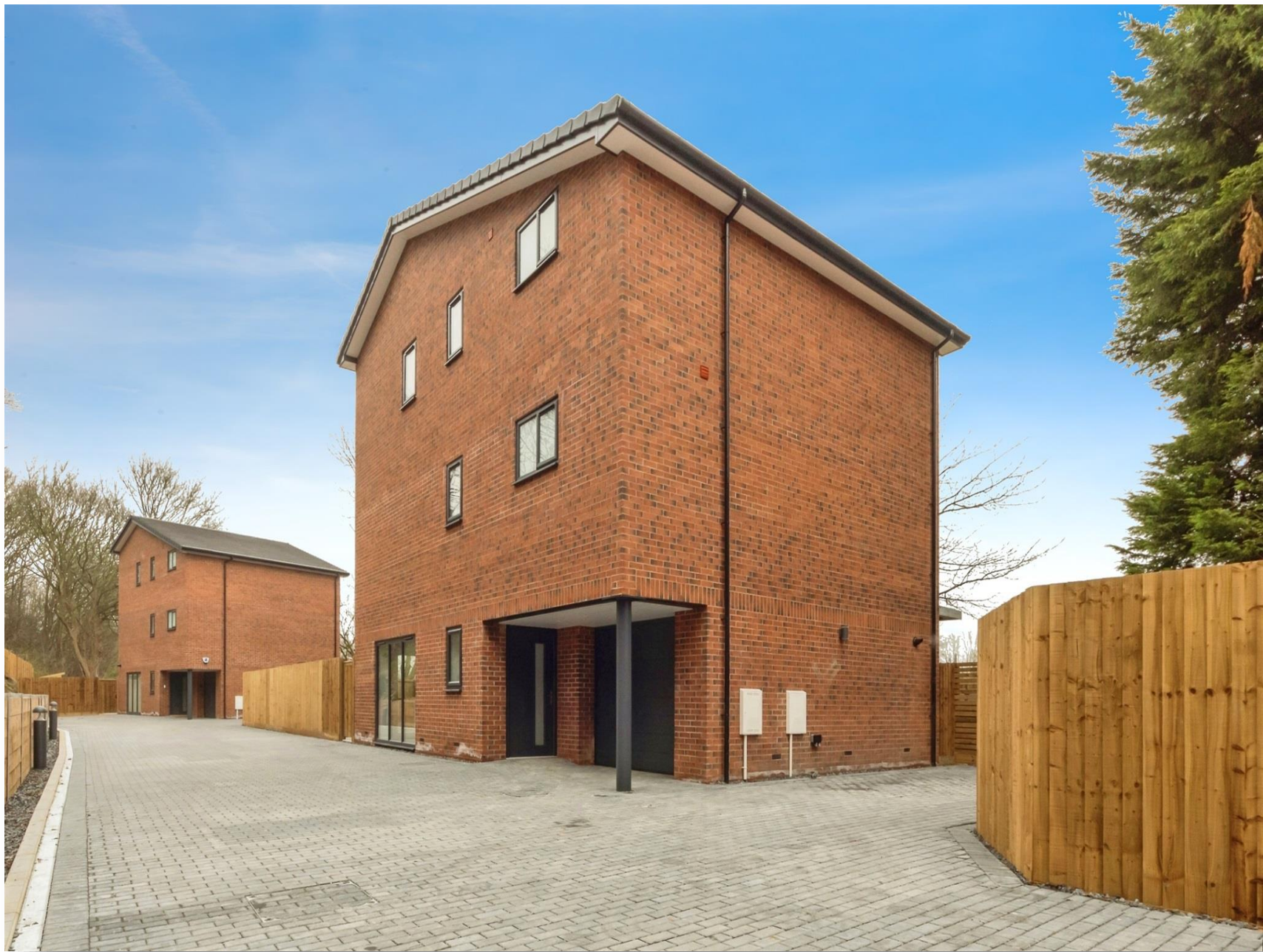
Jubilee Place Burton Road, Gedling Nottingham NG4 2QG