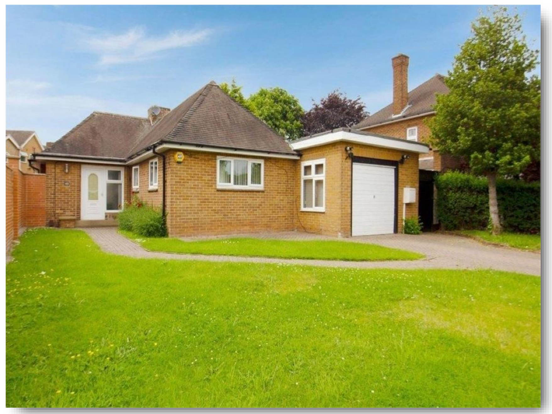
Trentham Drive, Nottingham NG8 3ND