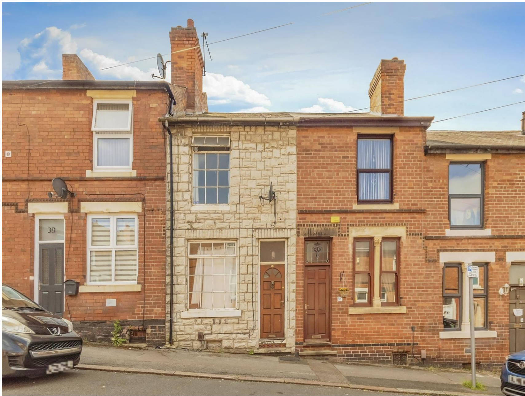
Worksop Road, Nottingham NG3 2BA