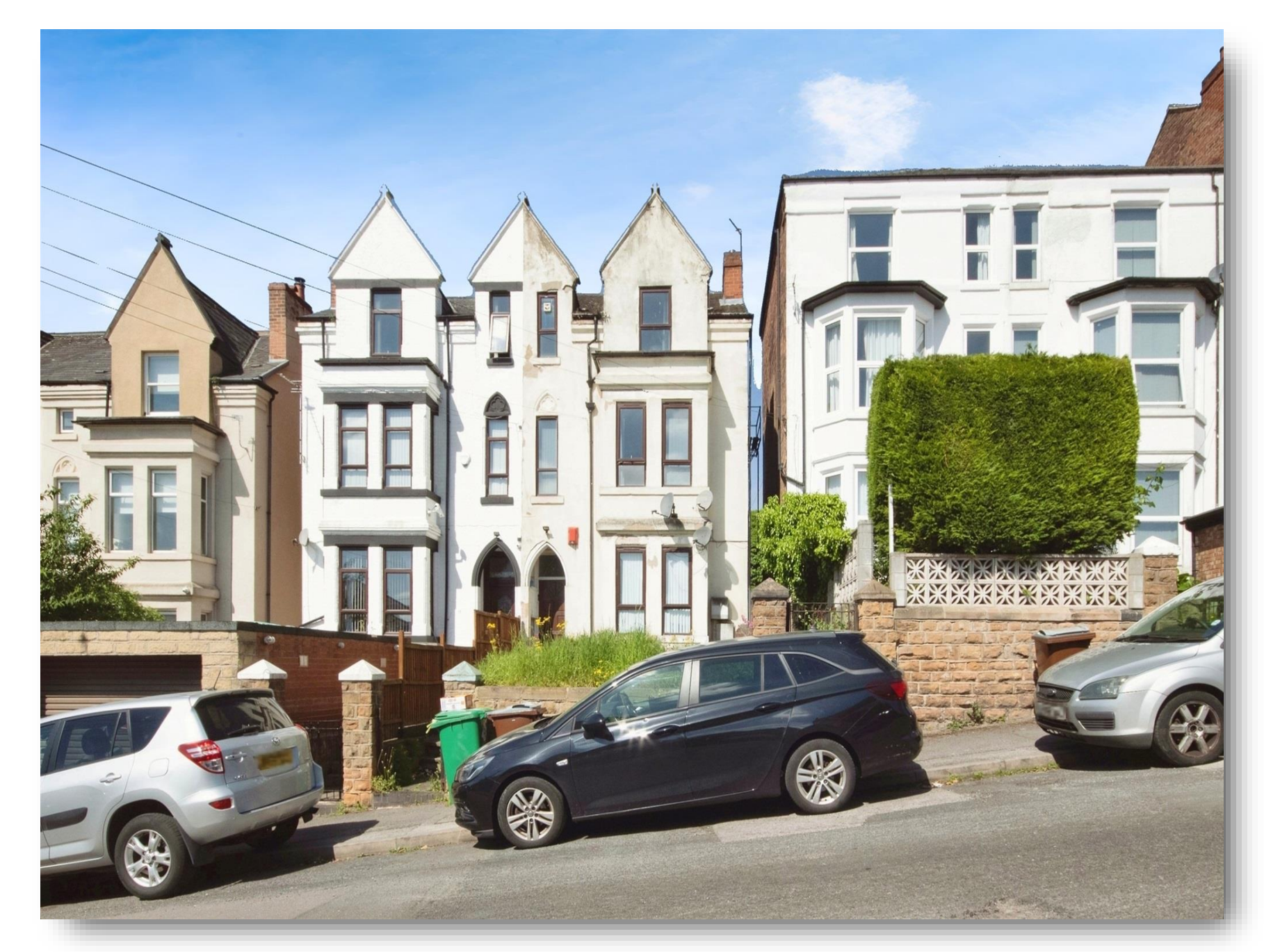
Goldswong Terrace, Nottingham NG3 4HB