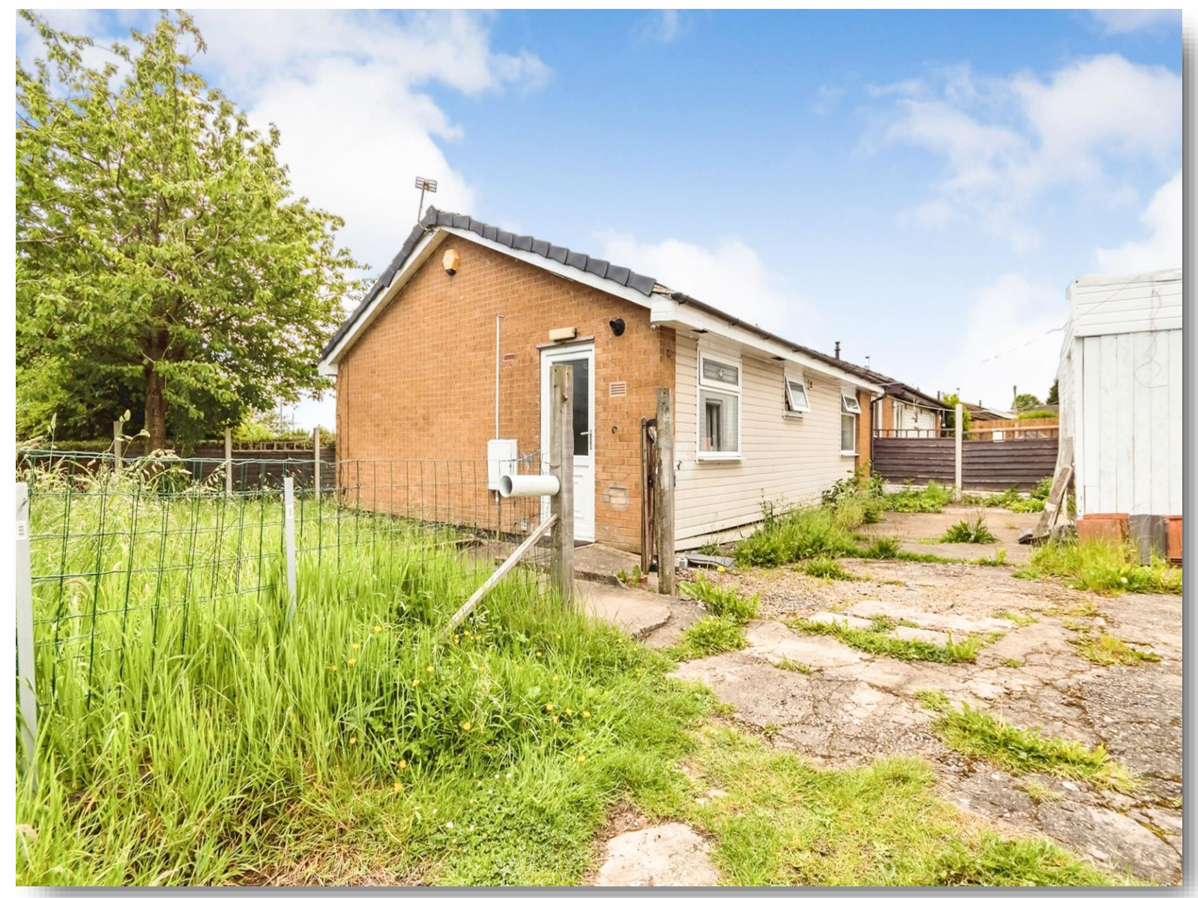
Wigman Road, Nottingham NG8 4PF