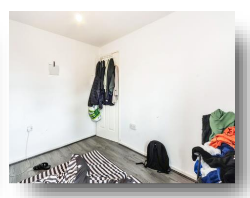
Alice's Childminding Monkton Dr