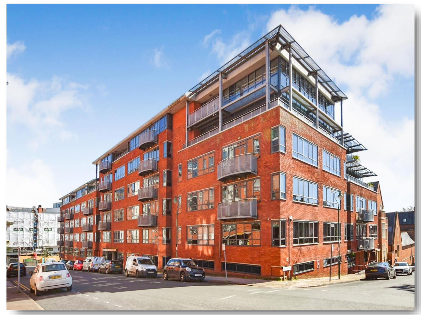
Parkgate Upper College Street, NOTTINGHAM NG1 5AP