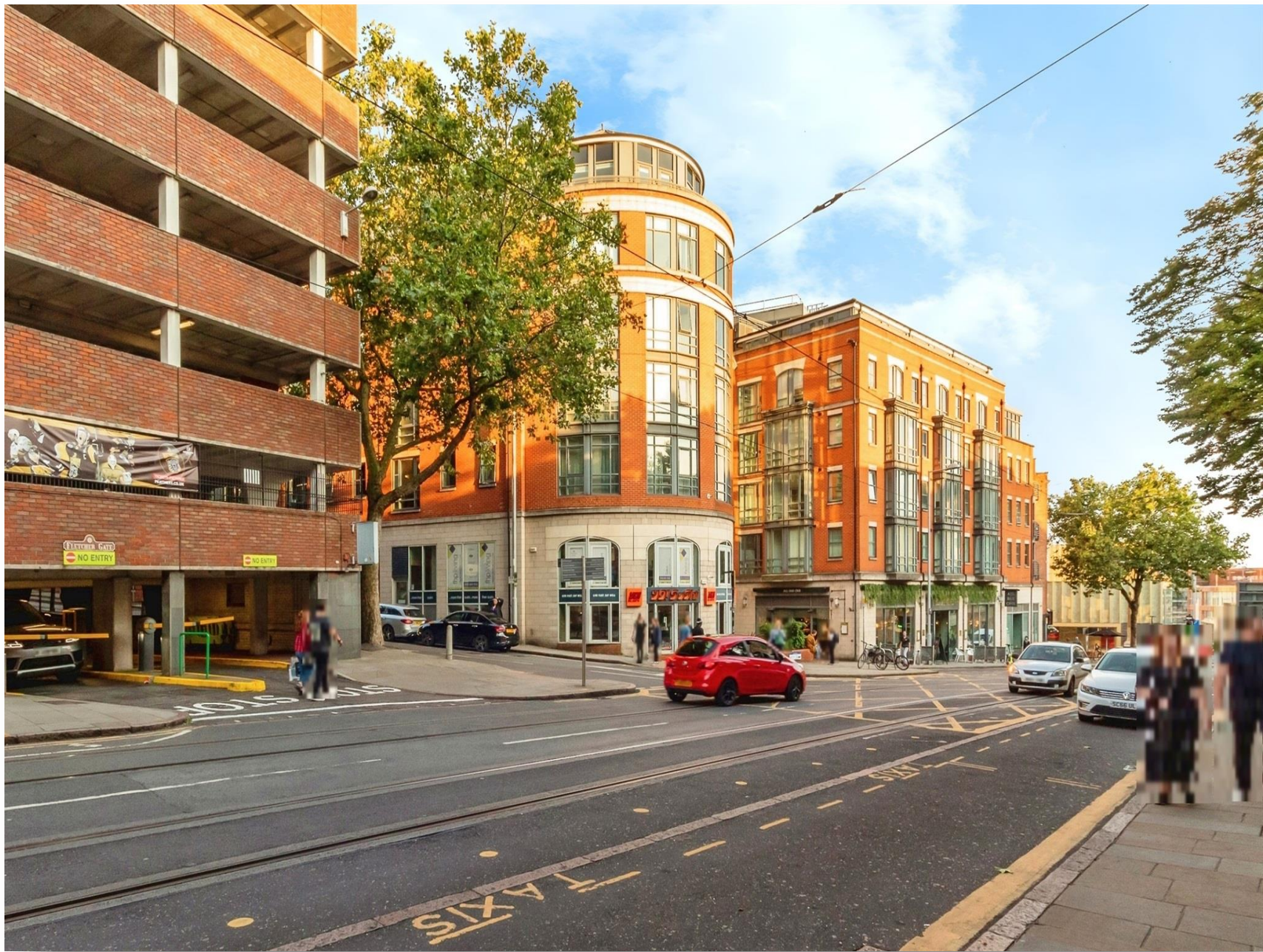
Weekday Cross Building Halifax Place, Nottingham NG1 1QL