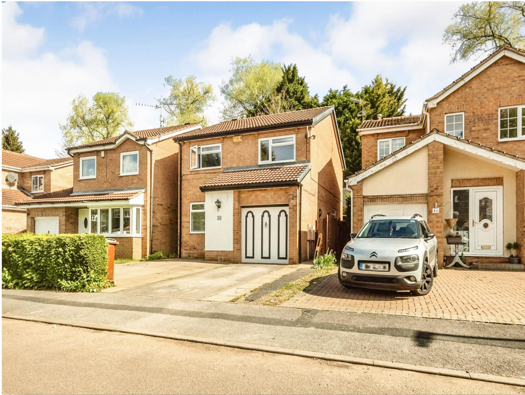
Camelot Avenue, Nottingham NG5 1DW