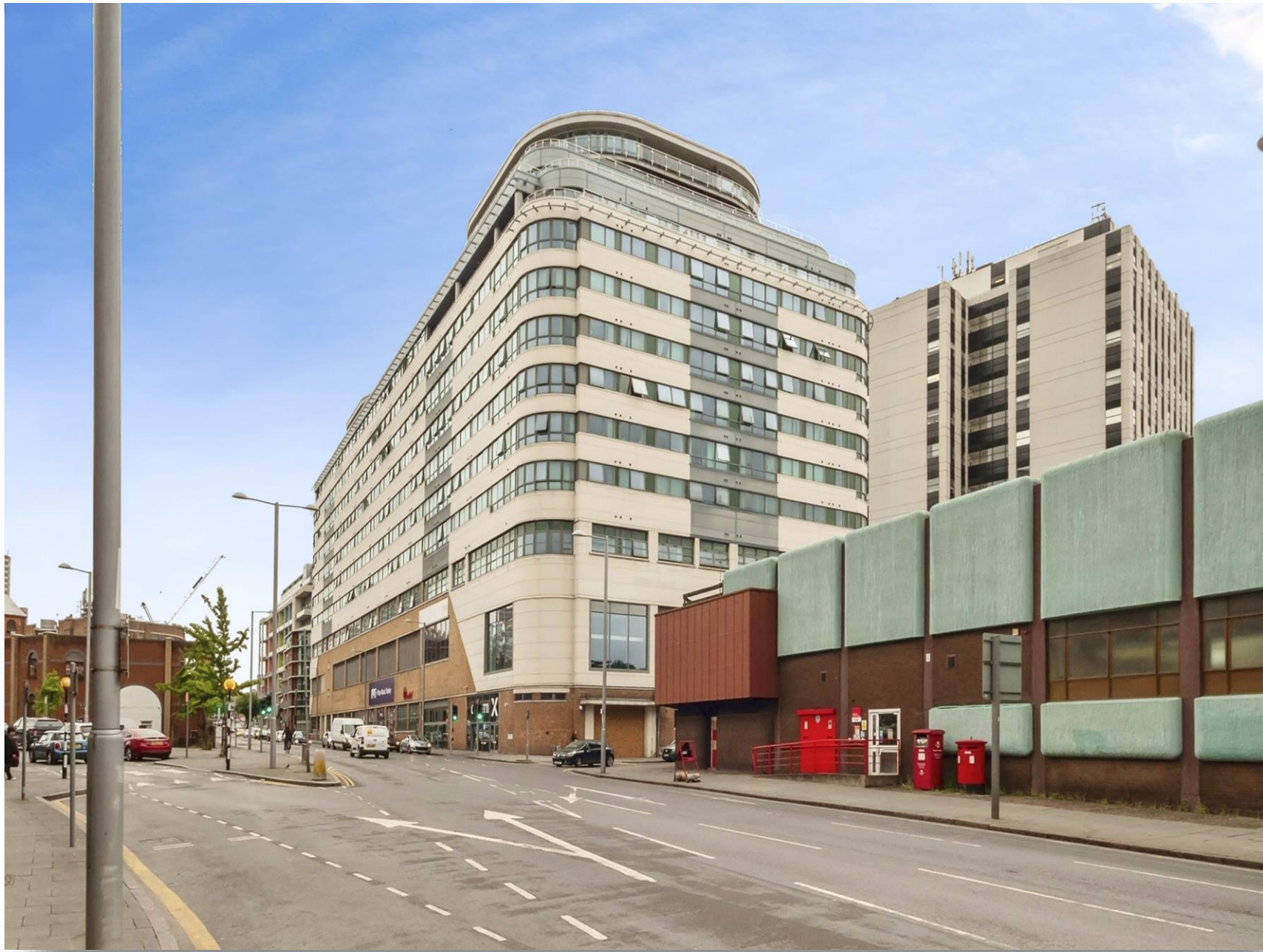
Marco Island Huntingdon Street, Nottingham NG1 1AW