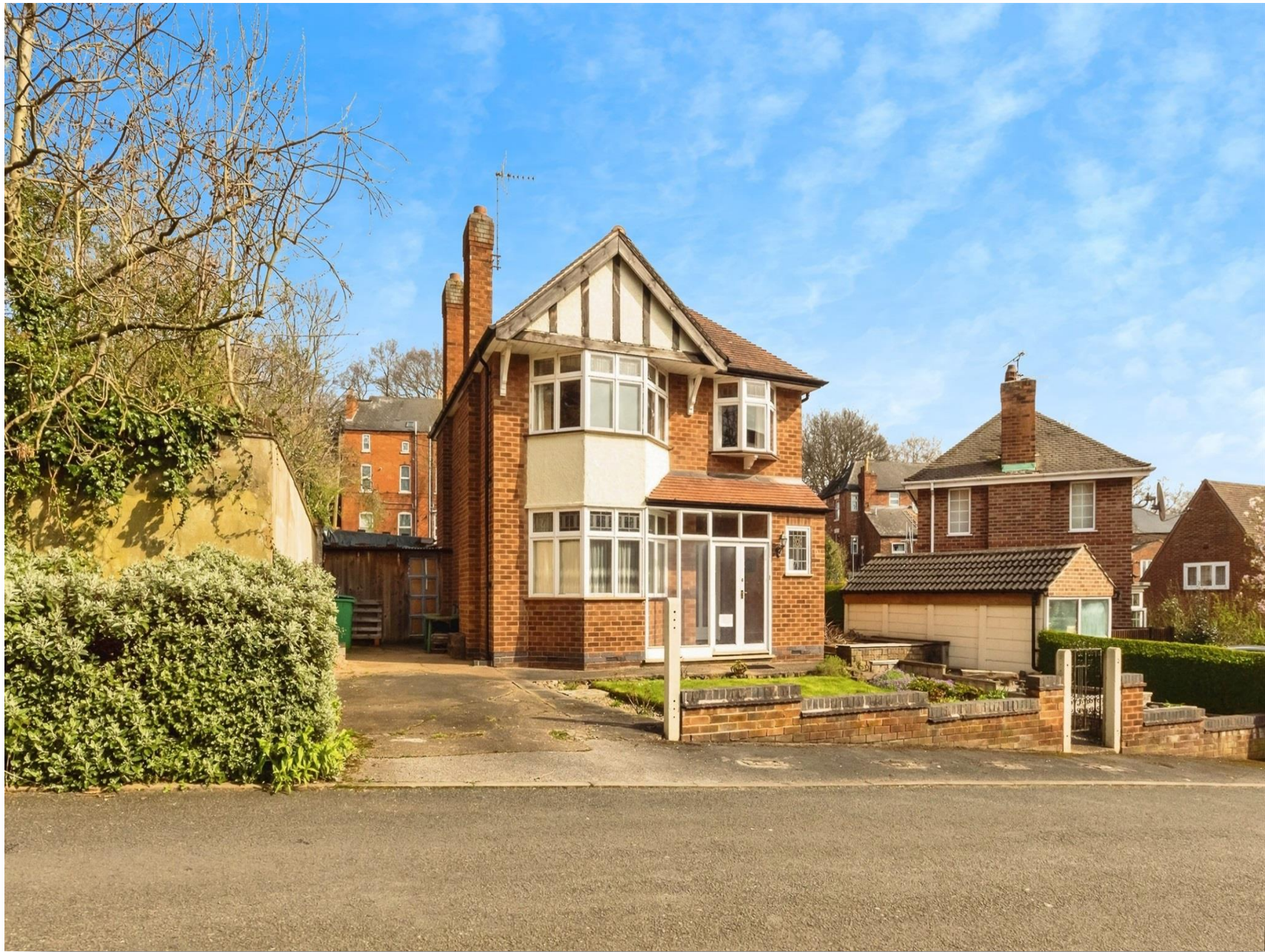
St. Anns Hill, Nottingham NG3 4LA