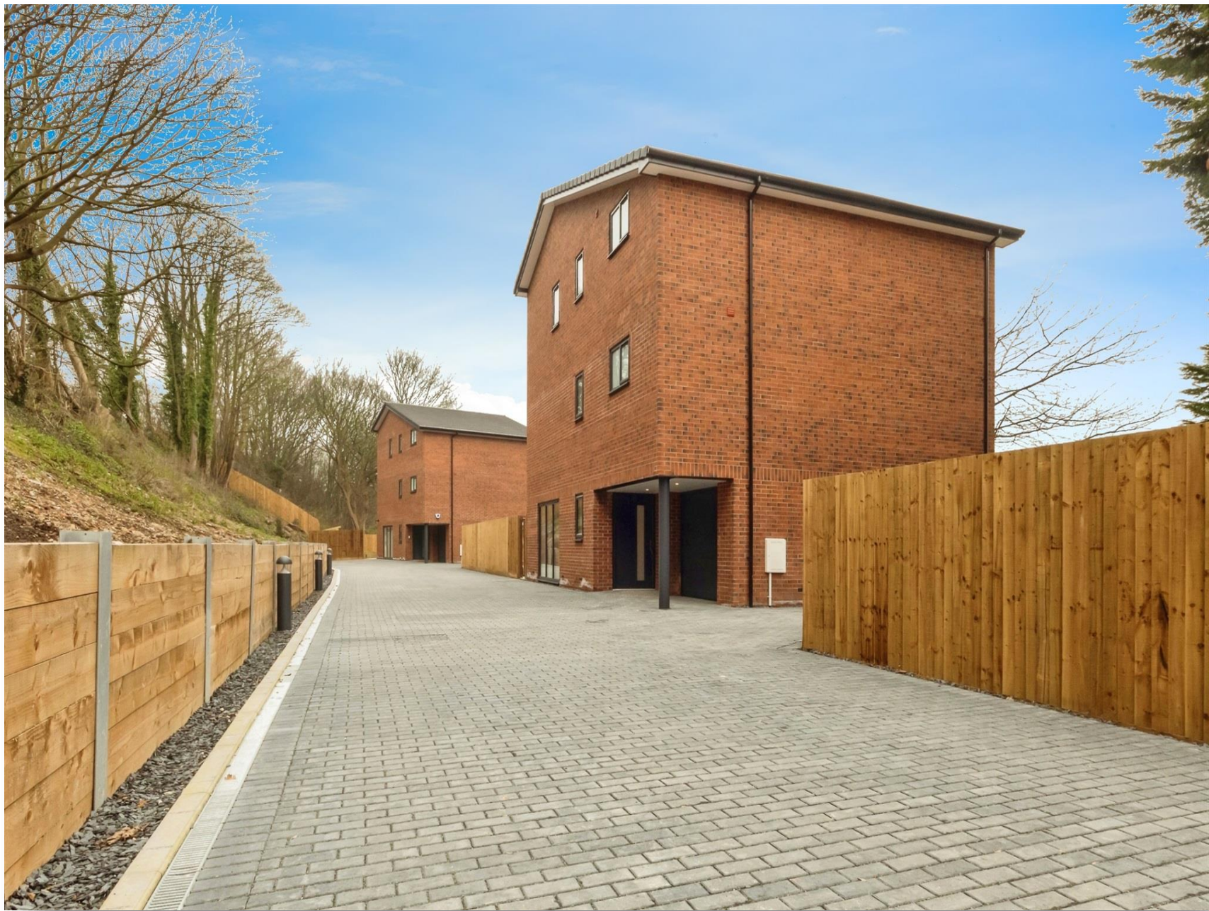
Jubilee Place Burton Road, Gedling Nottingham NG4 2QG