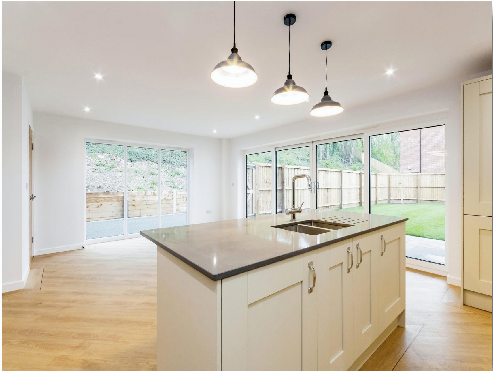
Jubilee Place Burton Road, Gedling Nottingham NG4 2QG