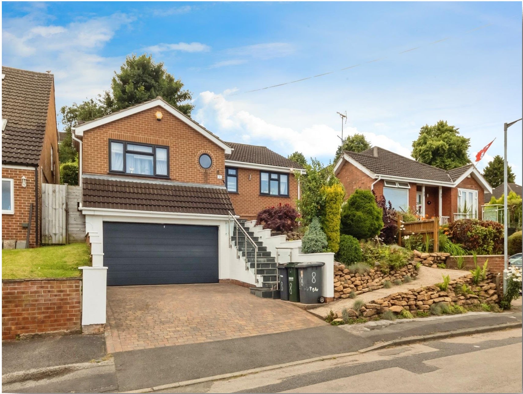
Pilkington Road, Nottingham NG3 6HL