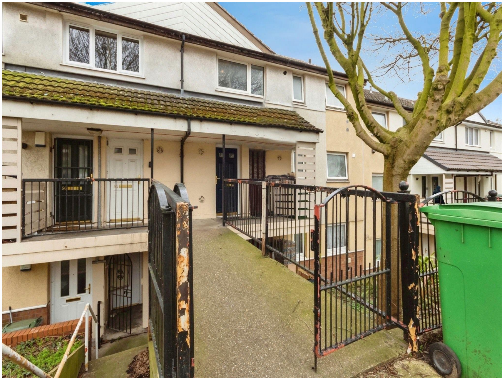
Lavender Walk, Nottingham NG3 4PS