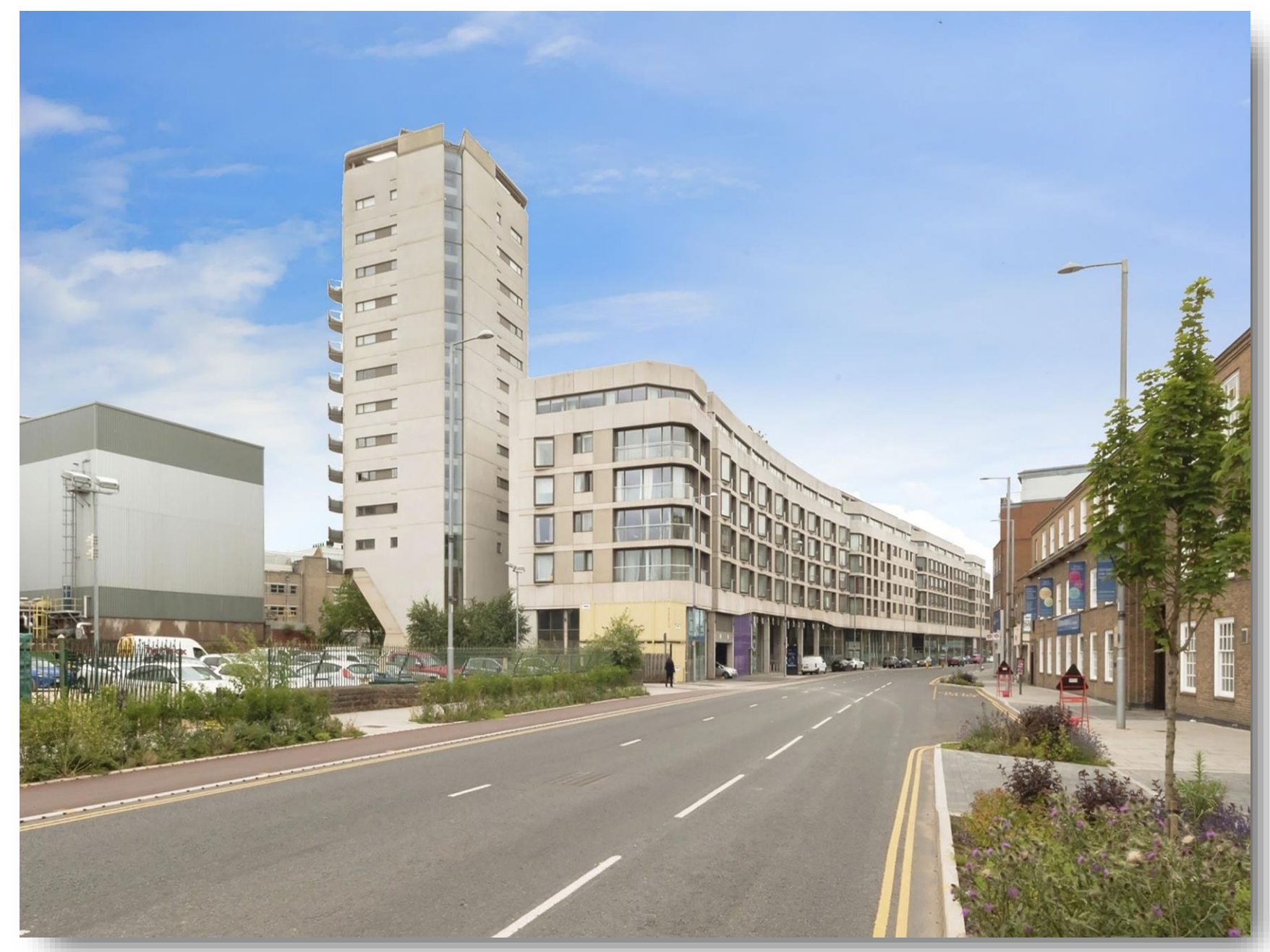
Nottingham One Canal Street, Nottingham NG1 7HT