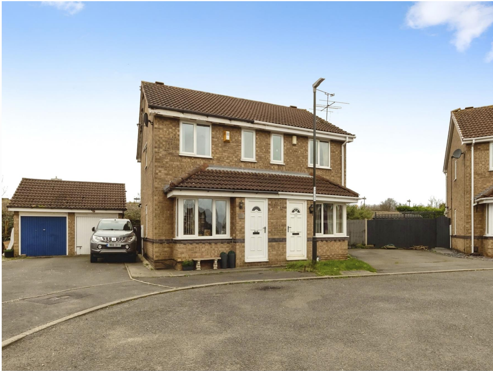
Pennie Close, Long Eaton Nottingham NG10 1HN