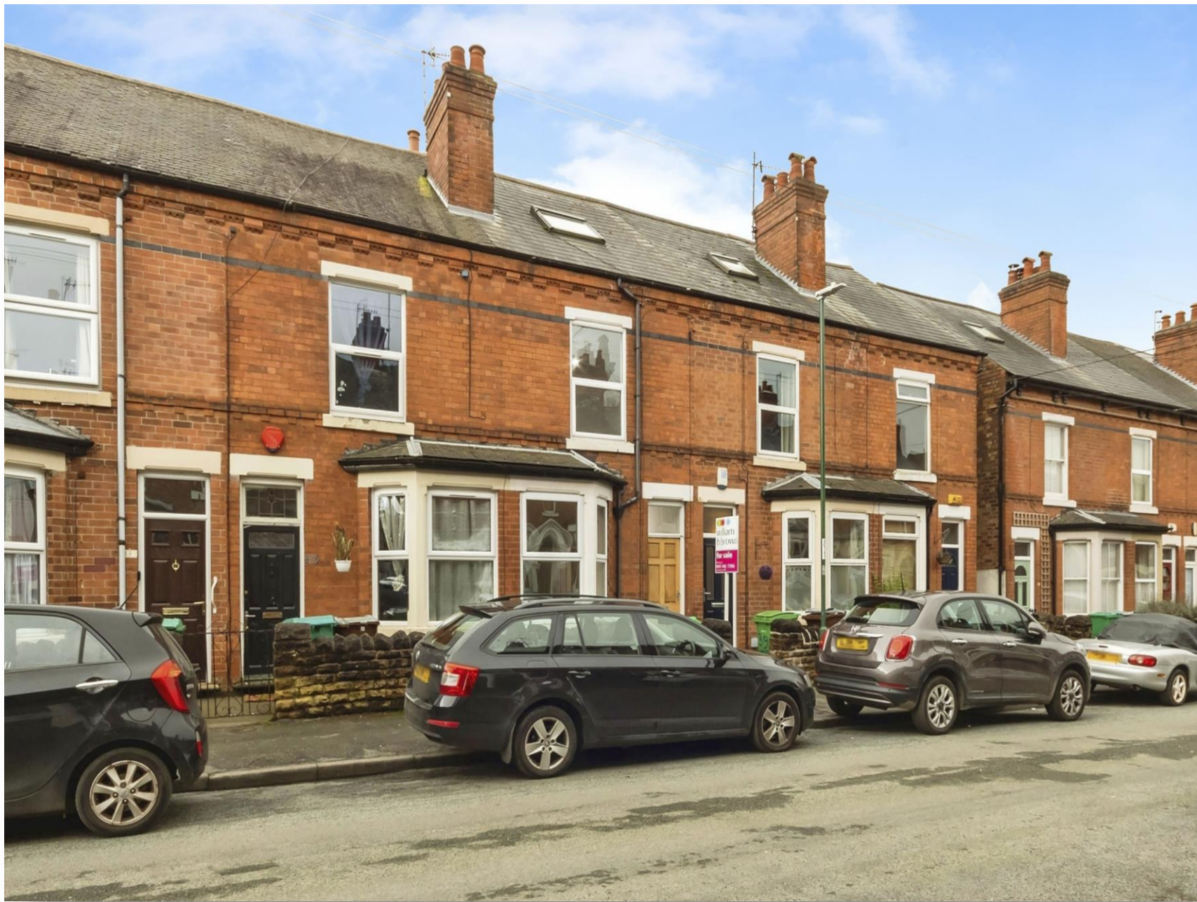
Crossman Street, Nottingham NG5 2HR