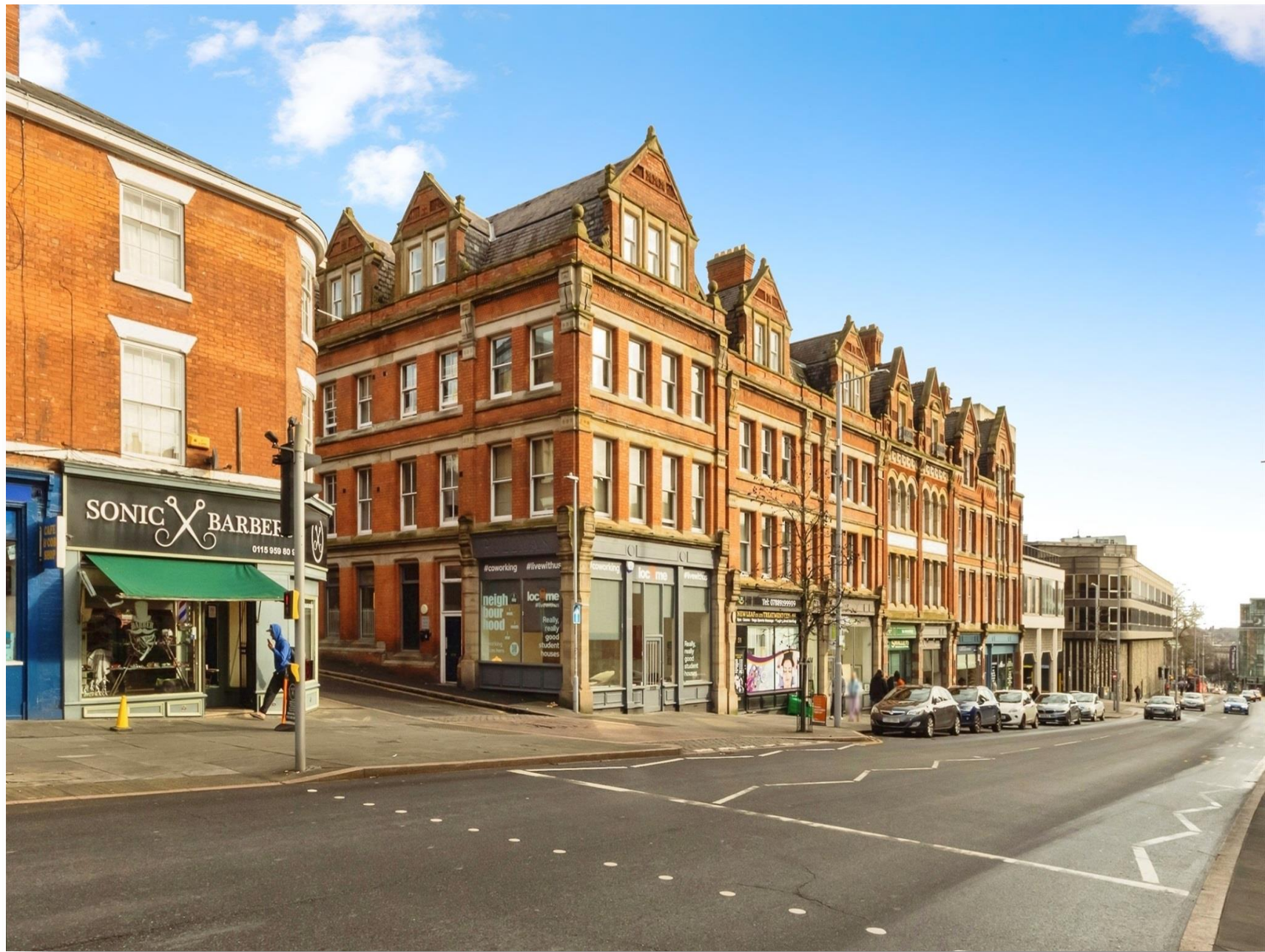
Regent Court Derby Street, Nottingham NG1 5FF