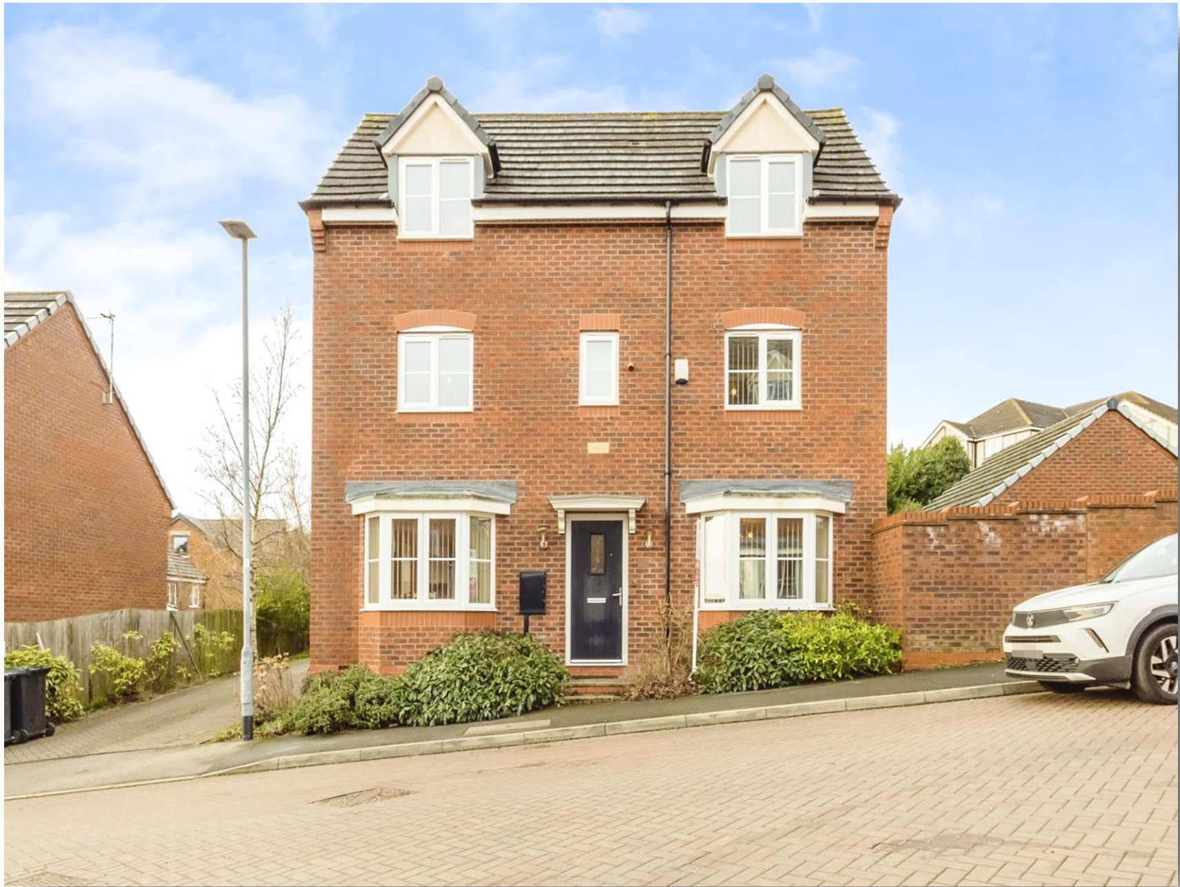
Bailey Drive, Nottingham NG3 5US