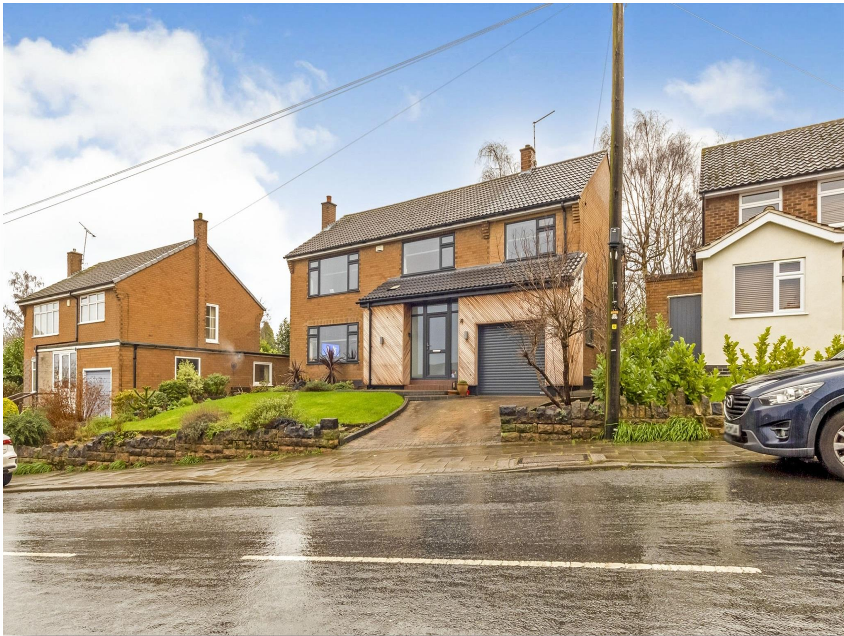
Walsingham Road, Woodthorpe NOTTINGHAM NG5 4NR